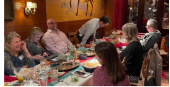
GAHE's Programs Committee gathers for 2022 planning session.

The Programs Committee is always looking for more volunteers. Please visit GAHE's Committee page to complete an application to join the committee.