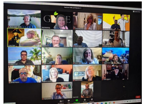
Virtual programs allowed GAHE to continue offering education credits to members.