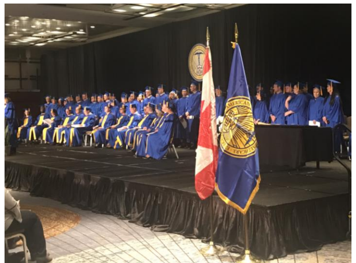
At the MacEachern Lecture